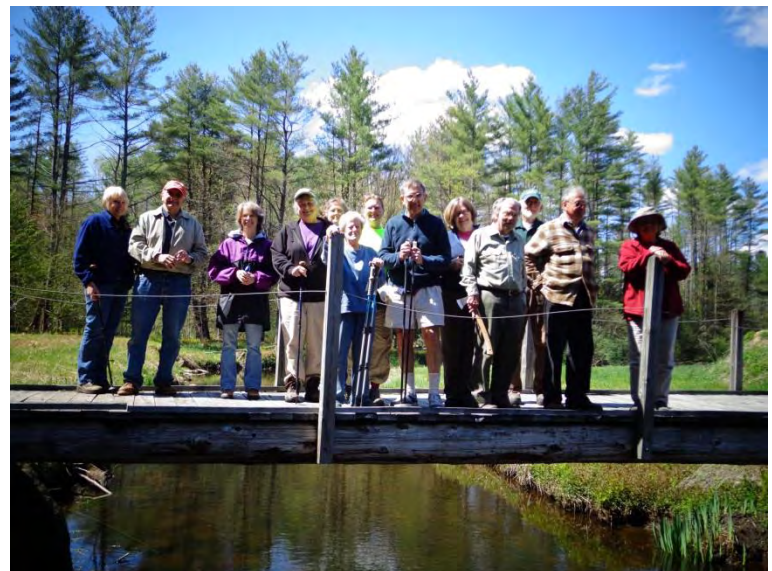
Hikers on bridge over East Creek near East Pittsford Dam.

Before and after pictures are on page 3 of this issue.